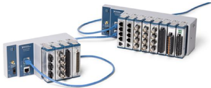
Figure 1. Easily expand your system with an integrated network switch for simple daisy chaining.

For long-distance, distributed systems, you can use a Time Sensitive Networking (TSN) enabled CompactDAQ device. TSN is the next evolution of the IEEE 802.1 Ethernet standard. It provides sub-microsecond synchronization over a distributed network of DAQ nodes. Precise timestamps and packet-based communication are used to share a common notion of time on all nodes in the network, which allows for accurate synchronization over long distances and eliminates the need for lengthy, physical timing cables.