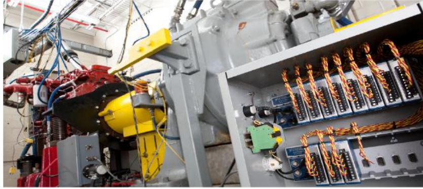
Figure 2. Spend less time preparing instrumentation for the rigors of field testing with CompactDAQ's extended temperature range, shock and vibration resistance.