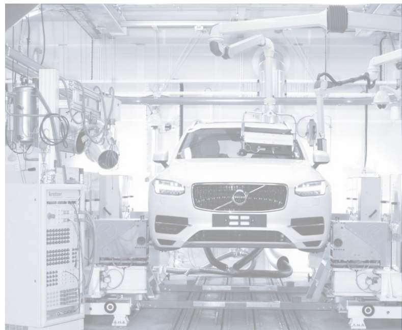
Volvo Car Group

Test and Measurement Technology. Designed for You.